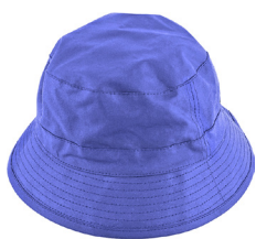
A sun hat