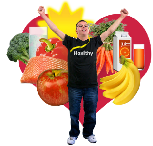
Support to stay healthy.