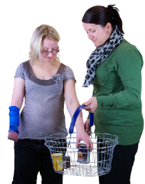
Help to be independent.