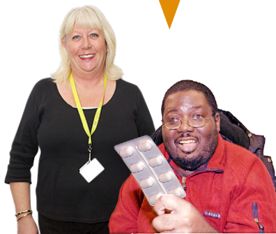
Help to check your medication is working properly.