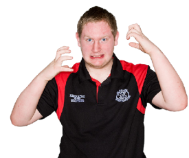
Help with how you behave.