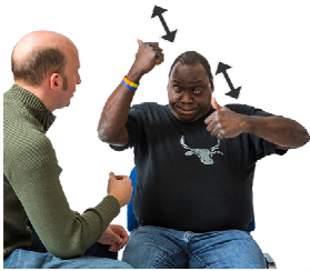
Help with communication.