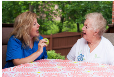
Help with eating, drinking and swallowing.