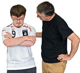
Help with your feelings.